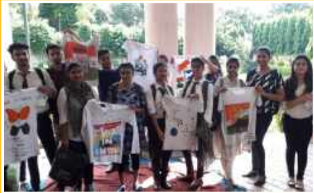
T-shirt Painting Competition