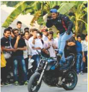
Bike Stunt Show