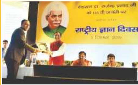
Impact Educationist Award