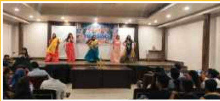
Folk Dance Competition